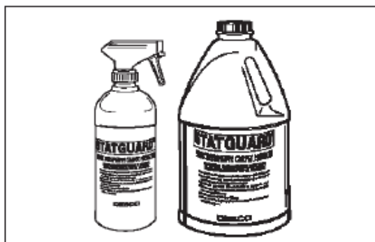
Figure 1. 81070 1 Quart spray trigger ready to use for dry application 81071 1 Gallon concentrate