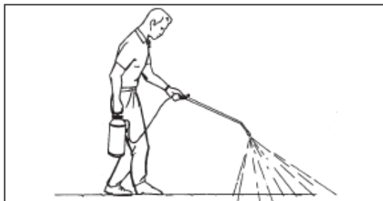
Figure 2. Compressed air sprayer in use.

Note: It is extremely important to obtain uniform coverage. Uneven application may result in uneven soil protection.